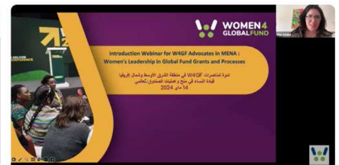
Women's Leadership in Global Fund Grants and Processes: Introduction for Advocates in MENA Region