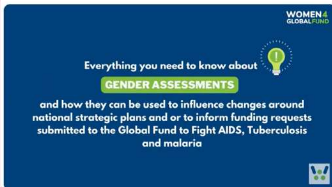
Essentials to know about the gender assessments

Access our videos and training webinars on our YouTube channel: